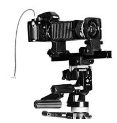
A bellows unit is in effect a flexible, variable-length extension tube.