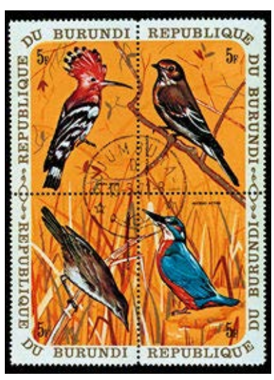
An extension tube equal in length to the focal length of the lens will result in a life-size image on the film.

A slide copier attaches to the bellows unit and permits not only copying slides, but adding special effects with filters.