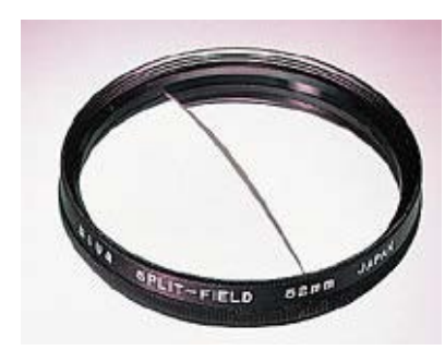
A split-field lens is a close-up lens cut in half

diopter number indicates how close your camera lens can focus with the close-up lens attached, in fractions of a meter. A +2 close-up lens will let you focus 1/2 meter away, a +3 close-up lens 1/3 meter away, and so on. These distances apply regardless of the focal length of the camera lens—a +4 closeup lens will let you focus 1/4 meter away whether attached to a 50mm lens or a 200mm lens. Note: These focused distances are based on the camera lens being set at infinity. When the camera lens is focused closer than its infinity setting, the combination of camera lens and close-up lens will focus even closer.