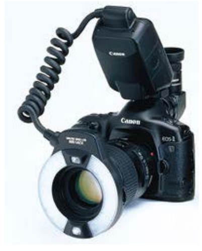
Ringlight flash units that encircle the lens are popular close-up light sources.