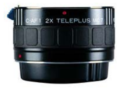
A tele-converter mounts between the camera body and lens, and increases the lens's effective focal length. This Kenko 2X Teleplus converter works with Canon EOS AF SLRs, providing a 2X increase in focal length while maintaining the lens's original minimum focusing distance.

200mm f/4 lens, and it becomes a 400mm f/8. Automatic converters that connect to the the camera's metering system will automatically compensate for this loss of light transmission when the camera's through-the-lens metering is used. With other converters, you must meter in the stopped-down mode. When using a separate hand-held meter and a 2X tele-converter, set the lens to an aperture two stops larger than the meter reading calls for: If the meter calls for f/11, set the lens aperture ring to f/5.6 (or increase exposure two stops by slowing the shutter speed).